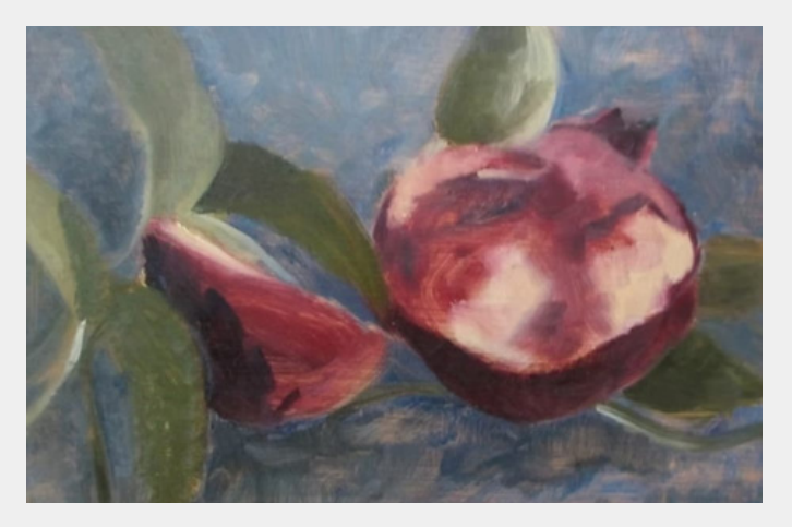
Ruth Eliav Pomegranate, oil on wood, 25X17cm, 2010

Ruth exhibits in solo and group exhibitions in Israel and abroad and teaches drawing and painting at the Israel Museum.