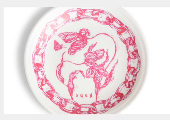
Palms and Tigers Printed porcelain saucer, diameter 13 cm

The studio started with a focus on hand mesh prints and has since expanded to create limited edition clothing and temporary home design items. Inspired by ruins, antiquities, mythological stories, Greek sculptures, botany, and exotic animals, the studio aims to produce unique, high-quality items that suit any space, event, or individual.